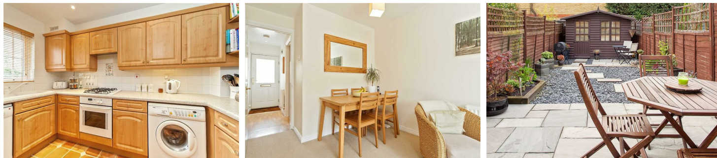
Ground Floor Approx. 29.4 sq. metres (316.5 sq. feet)

Beautifully presented throughout, this ultra modern two double bedroom terraced property boasts a lovely interior, complemented by luxury finishing touches throughout. The cloakroom and family bathroom are of an excellent quality. A driveway is situated to the front of the property and a beautifully, low maintenance landscaped garden provides the ideal space to relax at the end of a busy day. Also boasting a home office to rear.